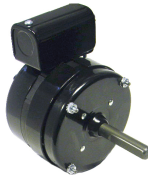
SS2609 - SS2612