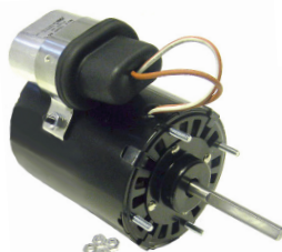
SS370 - SS371