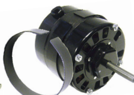
SS2657 - SS2658