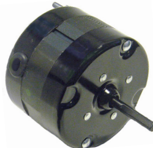
SS209 - SS214 - SS220