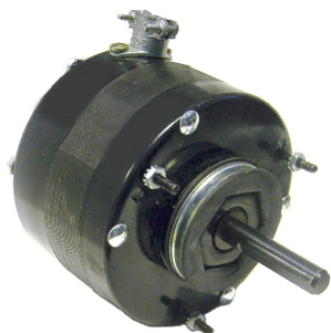
SS2615 - SS2360

Unit Heaters, Furnace Blowers, Refrigeration