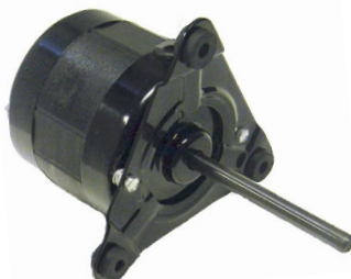
SS212S - MO-019