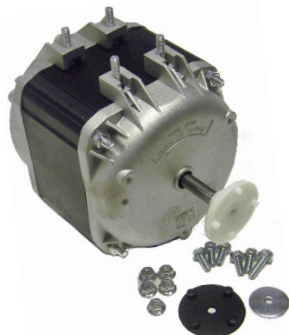
RMT0004 - RMT0005

OEM Replacement For Evaporator & Condenser Fans