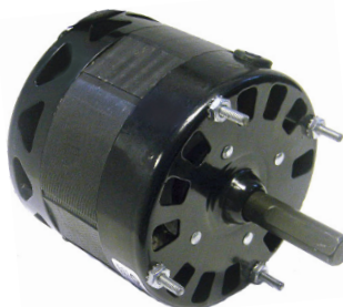
SS2603 - SS2604