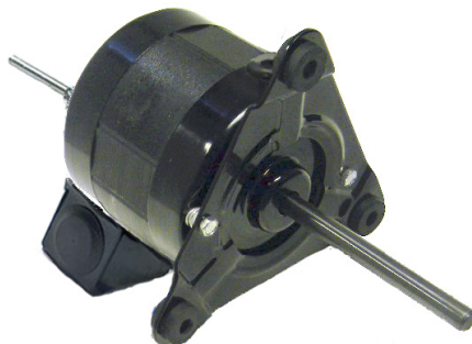
SS303 - SS213