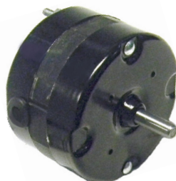
SS235 - SS236