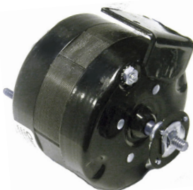
SS101L - SS103L