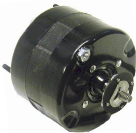
SS119 - SS120