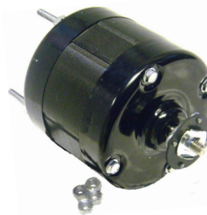
SS124 - SS125