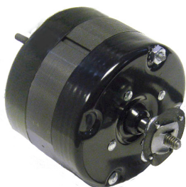
SS101 - SS103 - SS122