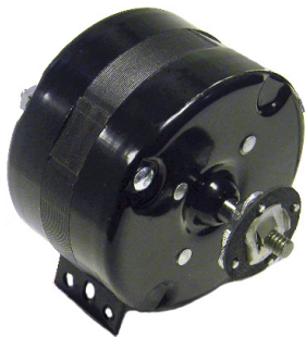
SS108 - SS123