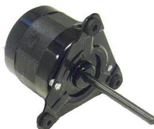
SS212S - SS212B - SS215