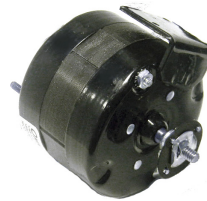
SS101L - SS103L